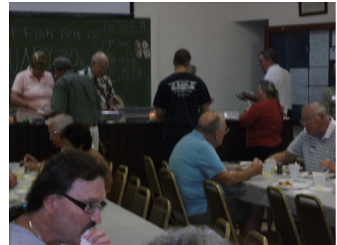
November 2011 Monthly Fish Fry