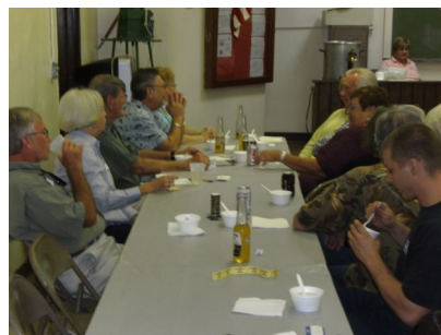
November 2011 Fish Fry